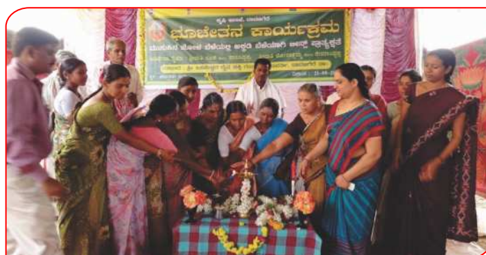
Field day on Mixed cropping of Maize with Beans

A field day on mixed cropping of Hybrid Maize with Beans was organized at Halavarthi village of