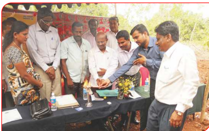
A sear on Seminar cum Workshop on Mango cultivation, rejuvenation and Beekeeping at Honnayakanahalli