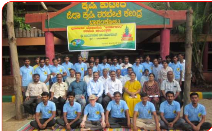
Participants in the "Awareness programme on Crop Estimation Scheme and efficient use of water soluble fertilizers"

A training program on "Awareness program on Crop Estimation Scheme and efficient use of water soluble fertilizers" jointly organized by Department of agriculture and IAT Bagalkot chapter, Zuari Holding Limited, Goa on 2nd August, 2012 to farmers facilitators of Bagalkot Taluka at DATC Bagalkot