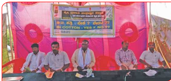
Participants on the Seminar on BT Cotton

A workshop on BT cotton whether required or not? was organized at Gowdagondanahalli village of Jagalur as a part of Agriculture Technology information dissemination celebration week jointly by IAT Davanagere, KVK, Krishik Samaj and ATMA project of Agriculture Department.