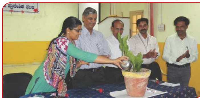
Participants in the programme