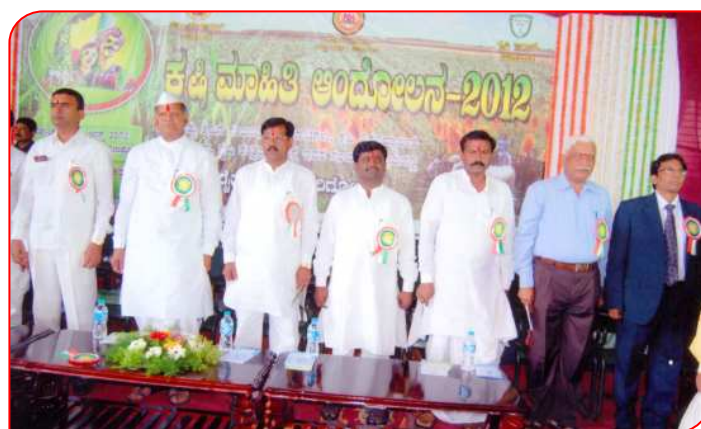
Sri. S.K. Bellubbi, Hon'ble Minister for Agriculture Marketing and WAKF Board, GoK and District Minister, Bijapur inaugurated Krishi Mahiti Andolan 2012.

This programme was organized in collaboration with Dept of Agriculture and with IAT chapter, Bijapur chapter on 15th August, 2012. This programme was inaugurated by District Minister Sri .S.K.Bellubbi, APMC & Waqf Board, GOK. In his inaugural speech Bijapur district although rich in resources but fail to utilize. The irrigation project in the district will increase the food grain production and horticulture crops also.