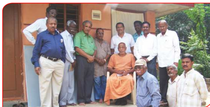
MC members at Rural Development Centre of the Ramakrishna Mission

As part of activities undertaken by the Sub-committee on Environment, Ecology and Pollution control, M.C.