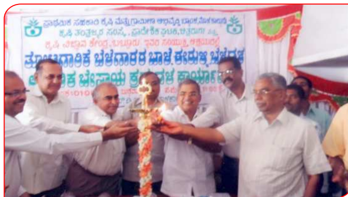
Participants in Training Programme on cultivation of Banana and Onion cultivation