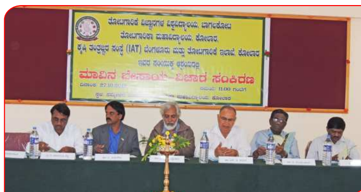
A snap shot on seminar on Mango cultivation at Kolar

A seminar on Mango cultivation was organised on 27th Oct, 2012 in the seminar hall of College of Horticulture, Kolar jointly by IAT, Bengaluru, University of Horticultural Sciences, Bagalkot and Department of Horticulture, GoK.